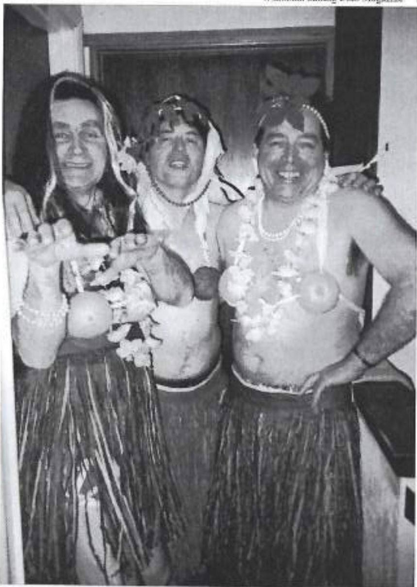
A night in the company of these young ladies to the first person to identify them. Warning: this photo was taken a few years ago - they may have lost some of their fresh appeal in the meantime...